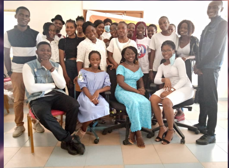
Recruited young women for the project