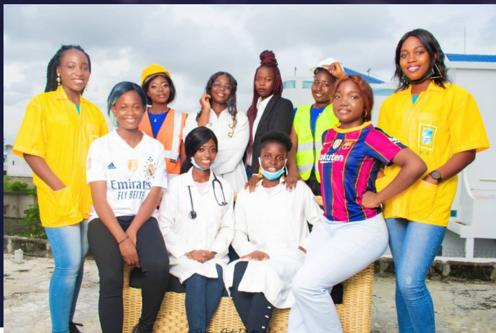
Campaign on gender equality at work