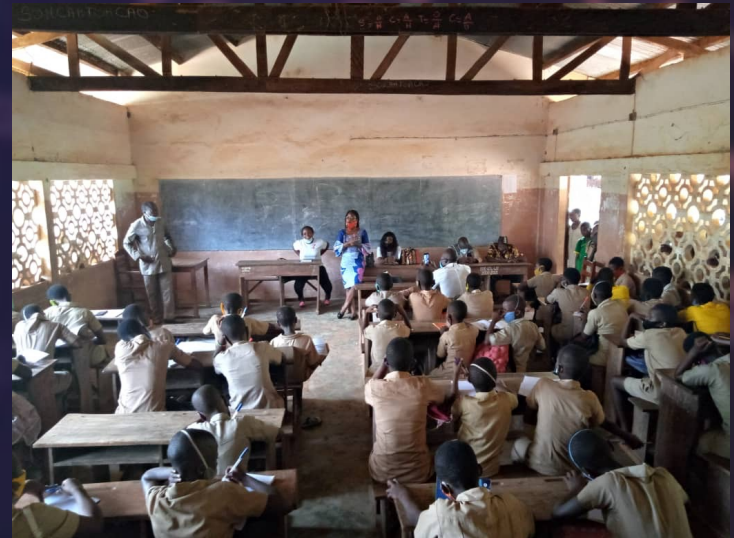
Breast cancer training in a school 4