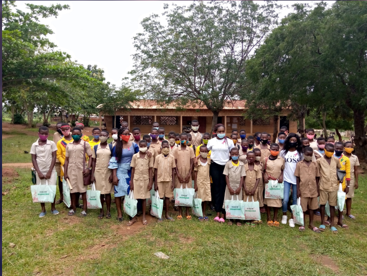
Donation of 50 school kits to a secondary school