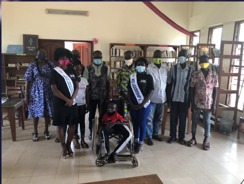
Visite in Equilibre NGO