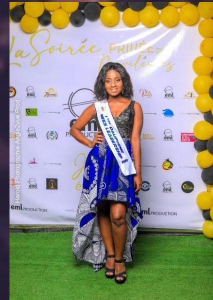
Invited to cultural and fashion events