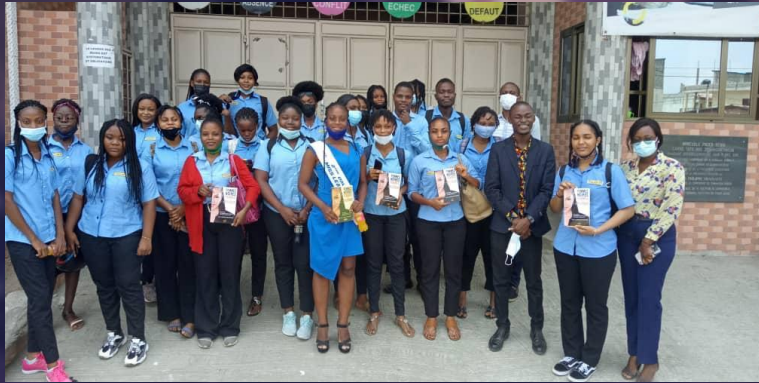
Reading activity in a university 8th March