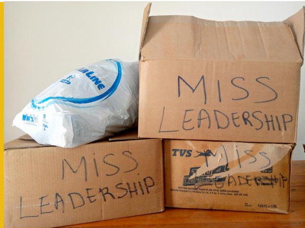
Collection of clothes and food for orphans