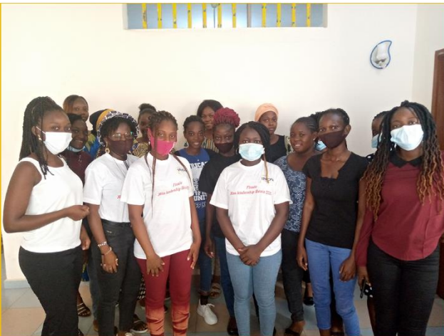
Training on the sexual health of young people